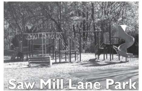
Saw Mill Lane Park

Any questions please call us at 215-643-3131