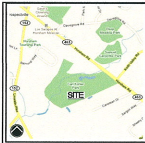
SITE LOCATION MAP 1" = 1,000'